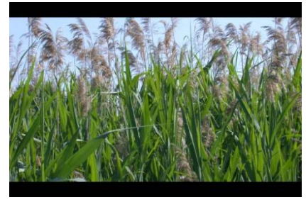
Phragmites - Common Reed