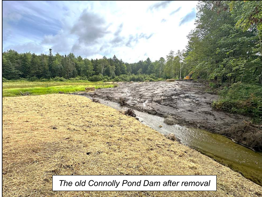
The old Connolly Pond Dam after removal

SLR Consulting, the design engineers for this project recommended a relatively passive approach to dam removal for this project. "The plan is to remove the middle three-quarters of the dam while leaving the ends in place near the valley walls. This approach is the most cost-effective way to improve public safety, restore aquatic organism passage, and naturalize sediment transport. It also returns the site to the most likely pre-dam condition –